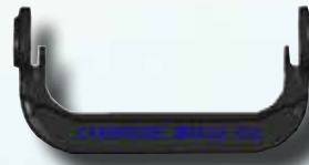
Iron Yoke Setters & Fittings