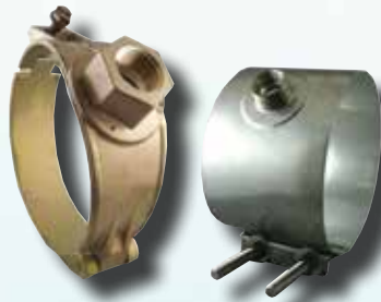
Brass & Stainless Steel Saddles