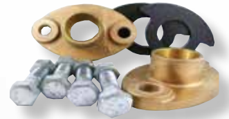
Meter Setter Accessories