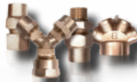
Service Line Fittings