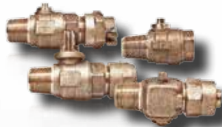
Corporation Main Stops