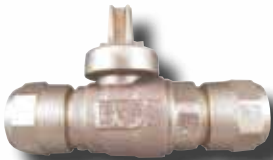
Curb Stops & Meter Valves